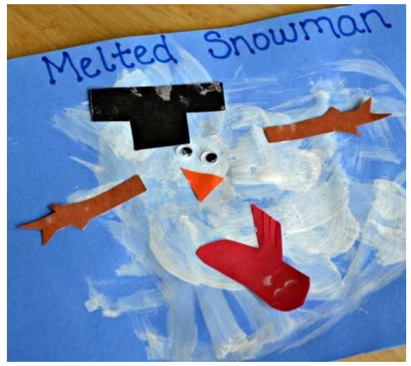
A finished Melted Snowman

Inspired by the books: Snow Party and Stranger in the Woods GRADES: Pre K - 2nd