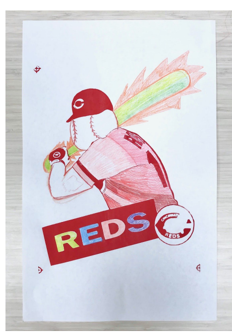
A Reds Baseball Print