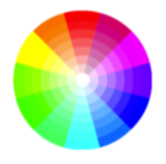
ASK: What colors do you see? Are they warm, cool, or neutral?

Color Theory: Primary, Secondary, Tertiary, Complementary, Analogous, Neutrals, etc.