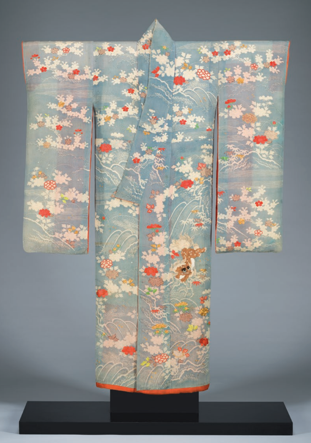
Japan, Kimono , mid 19th century, silk, metallic thread, Cincinnati Art Museum, Gift of Edward Senior, 1974.16

Western artists were among the earliest collectors of Japonism. Collecting everything from ukiyo-e (woodblock prints), lacquerware and ceramics to textiles and kimono, artists like James McNeil Whistler and James Tissot often incorporated these Japanese objects into their paintings. This stunning gray-blue silk crepe Kimonodecorated with blossoming trees, peonies, hills, waterfalls, bamboo, clouds and komainu (lion-dogs), is an excellent example of the type of kimono collected by Western artists. While not the same garment, it is very similar to the robe represented in the painting of a Girl in a Japanese Costume by William Merritt Chase. Like many of his peers and patrons, Chase was an avid collector of Japanese art and design.