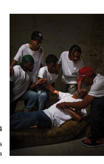
Gallery 204 Europe 1100s-1500s intervention by John Edmonds