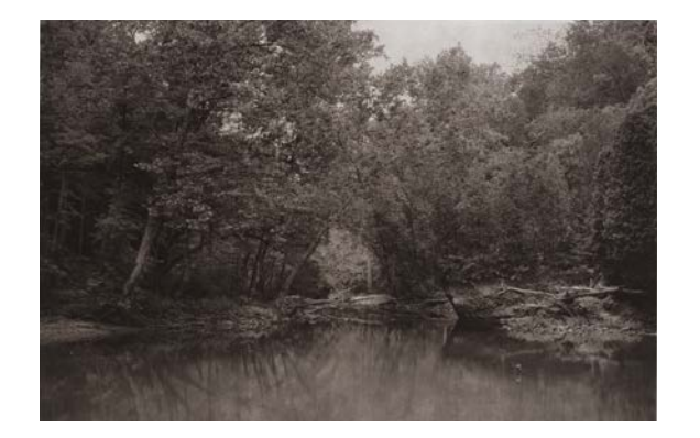
Gallery 106-7 Cincinnati 1800s intervention by David Hartt