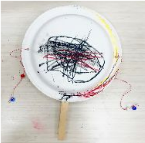
A finished Bolang Gu-inspired instrument