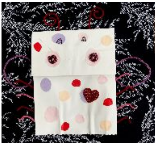
Finished love bug project