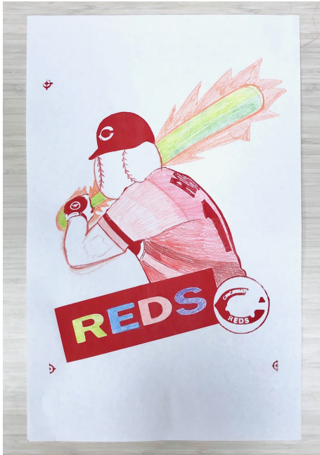
A Reds Baseball Print