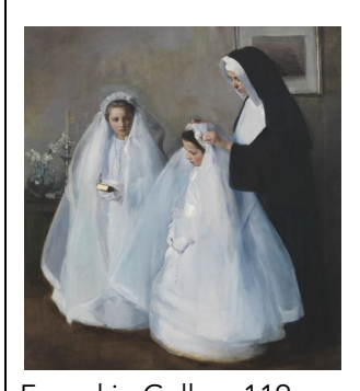
Found in Gallery 119