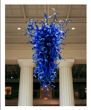
Found in the Main Lobby

Find credit lines for artwork at the end of the worksheet.