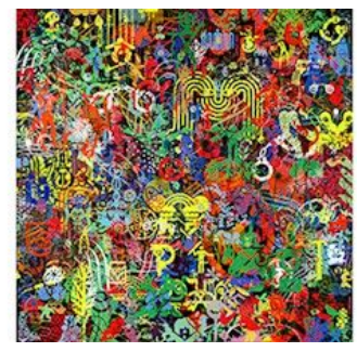
Found in Gallery 302