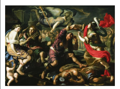
Found in Gallery 202