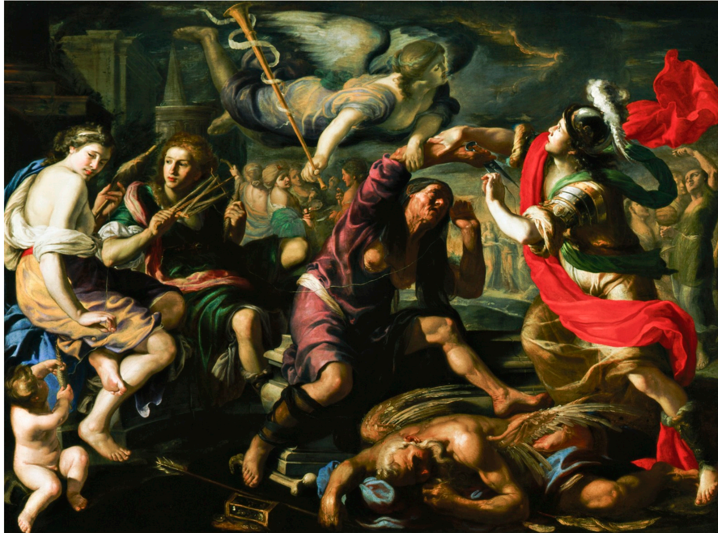
Bernardino Mei (1612-1676), Italy, Alexander the Great and the Fates , circa 1667, oil on canvas, The Edwin and Virginia Irwin Memorial, 1988.167