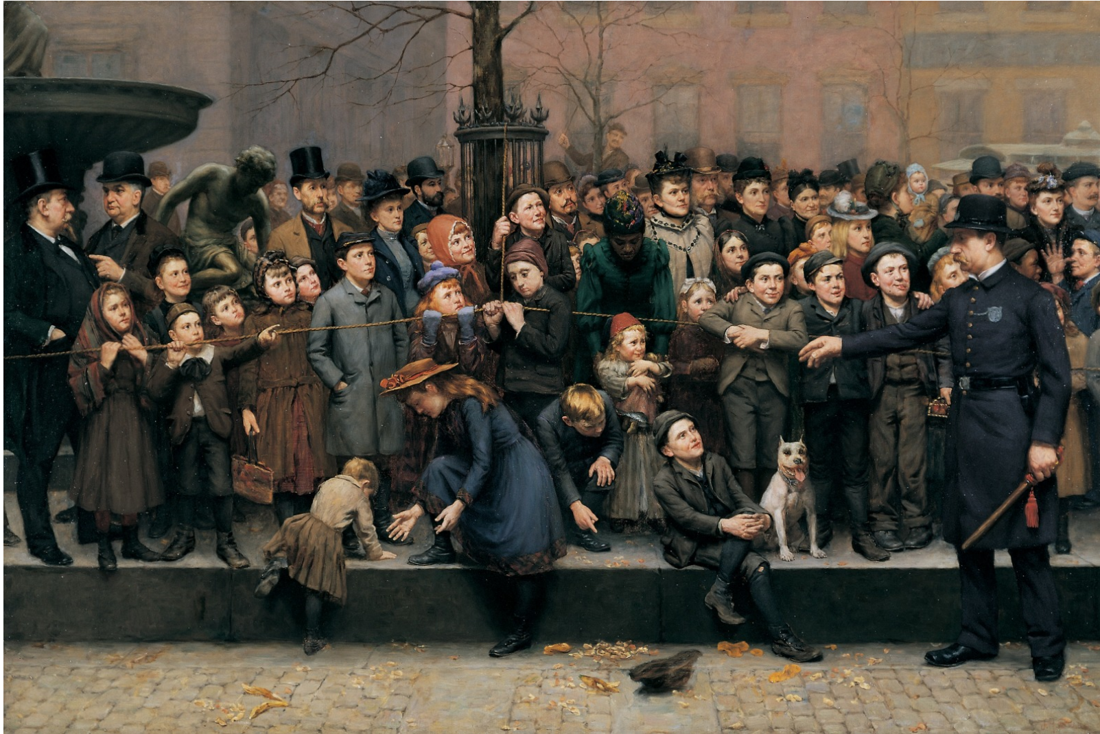
Joseph Henry Sharp (1859-1953), United States, Fountain Square Pantomime , 1892, oil on canvas, The Edwin and Virginia Irwin Memorial and Gift of The Docents of the Cincinnati Art Museum in celebration of their 40th Anniversary, 2000.68