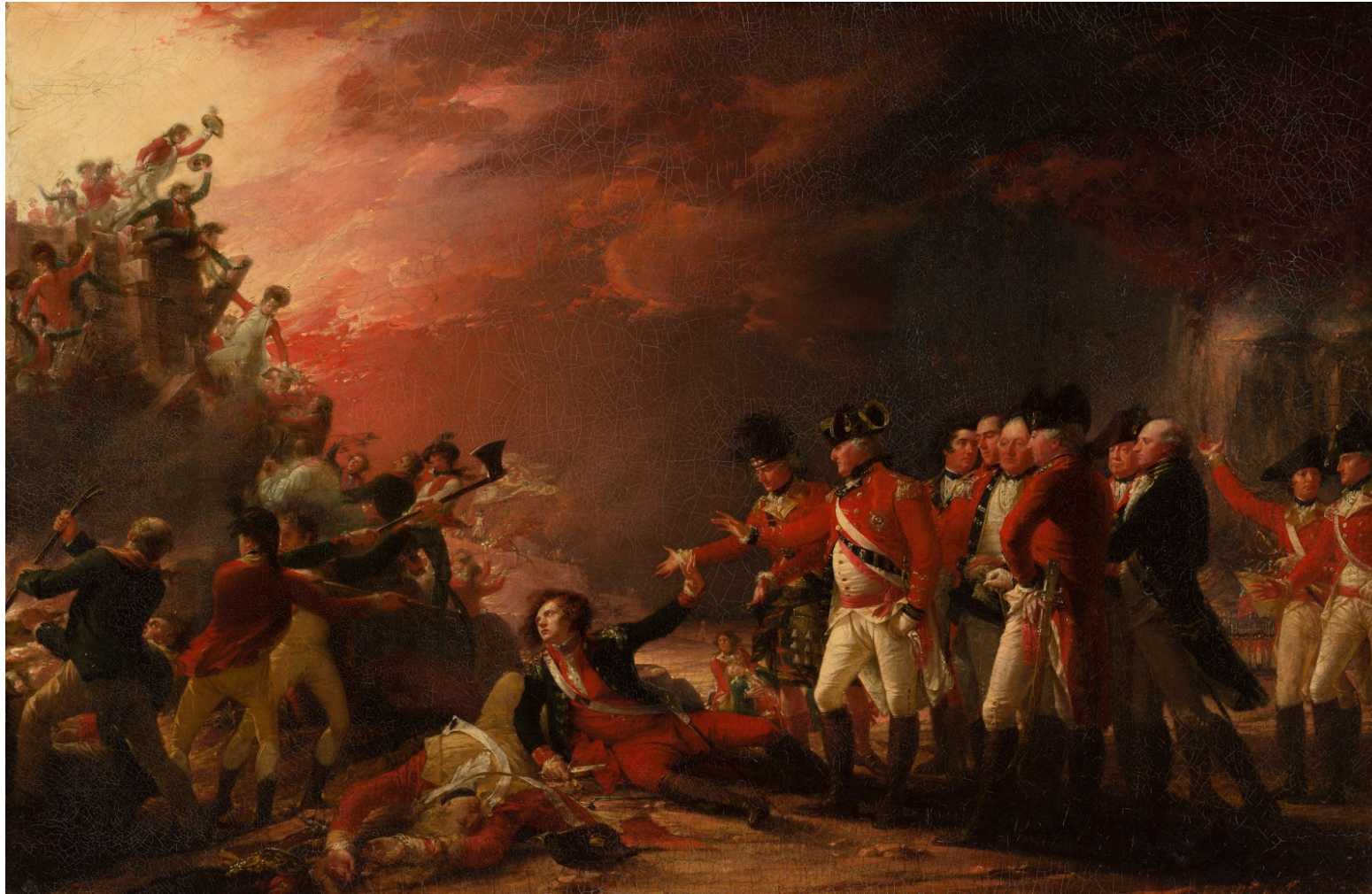
John Trumbull (1756-1843), United States, The Sortie Made by the Garrison of Gibraltar, 1788 , oil on canvas with wood insert in stretcher, John J. Emery Fund, 1922.104

Are you English or Spanish? What role do you play? Share.