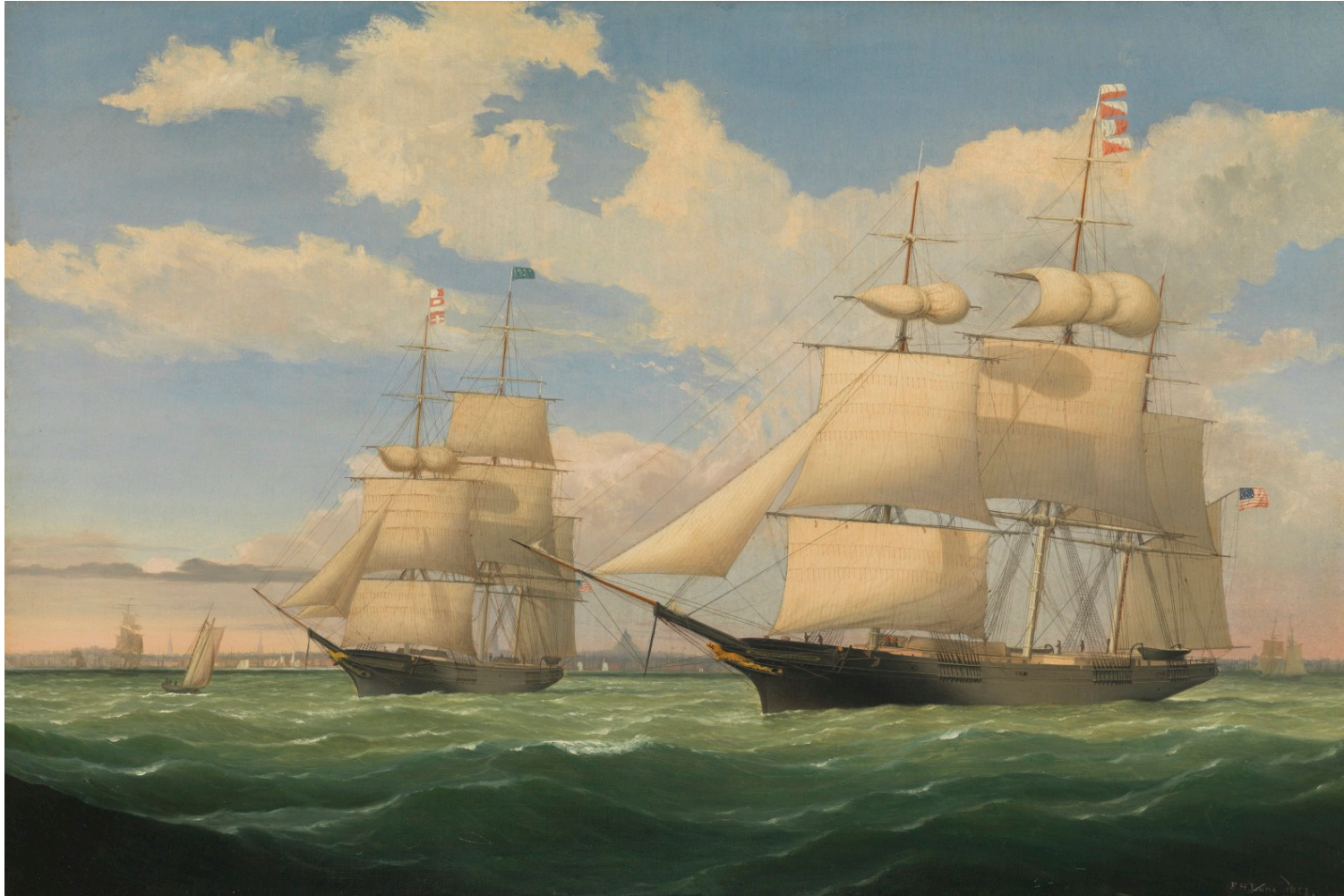
Fitz Henry Lane (1804-1865), United States, The Ships "Winged Arrow" and "Southern Cross" in Boston Harbor , 1853, oil on canvas, The Edwin and Virginia Irwin Memorial, 1971.31

Share one adventure you hope to have while on board.