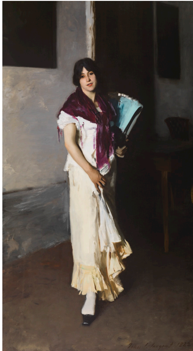
John Singer Sargent (1856-1925), United States, A Venetian Woman , 1882, oil on canvas, The Edwin and Virginia Irwin Memorial, 1972.37