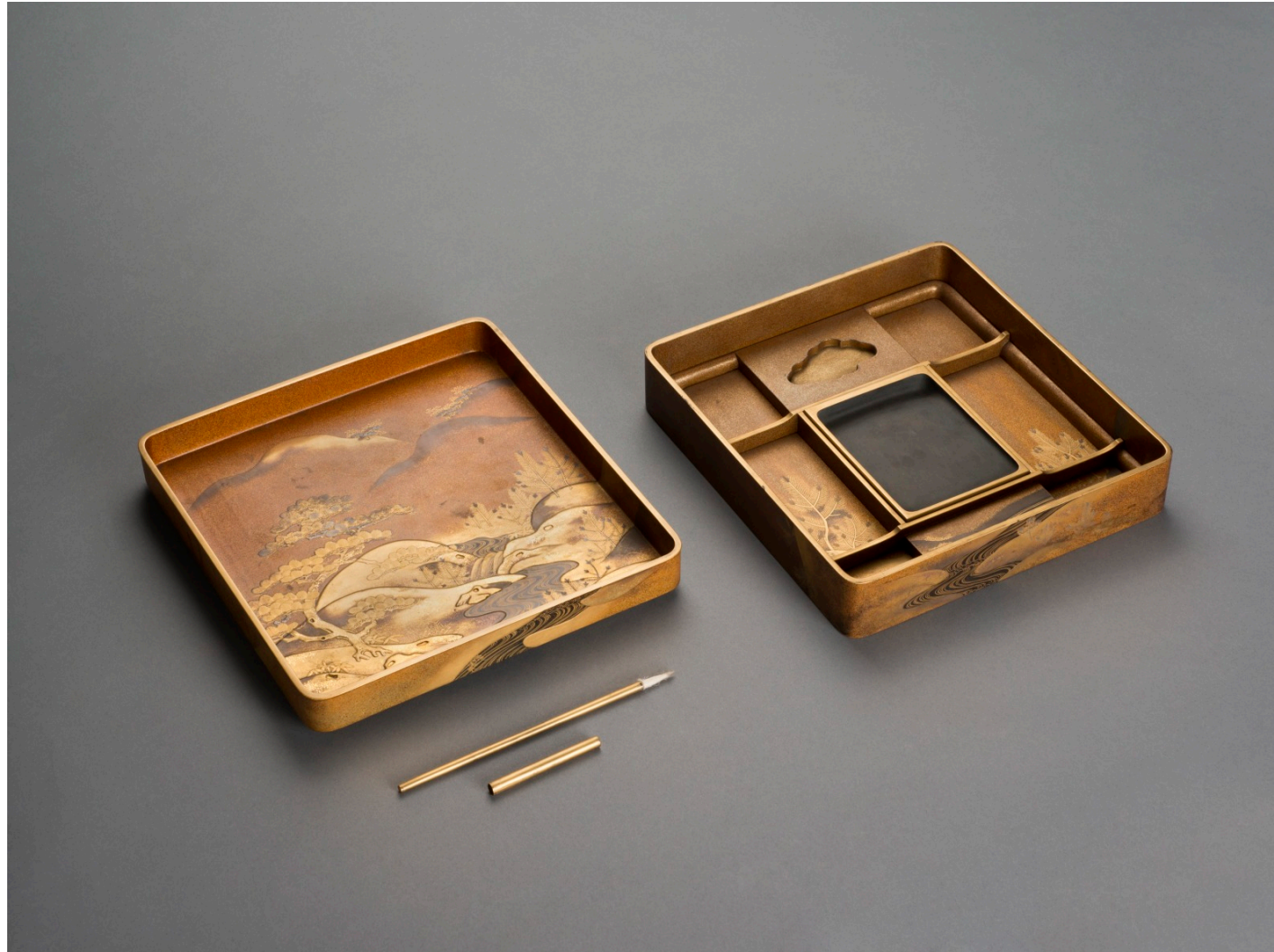
Japan, Writing Box, 19th Century, gold lacquer, Museum Purchase, 1889.310