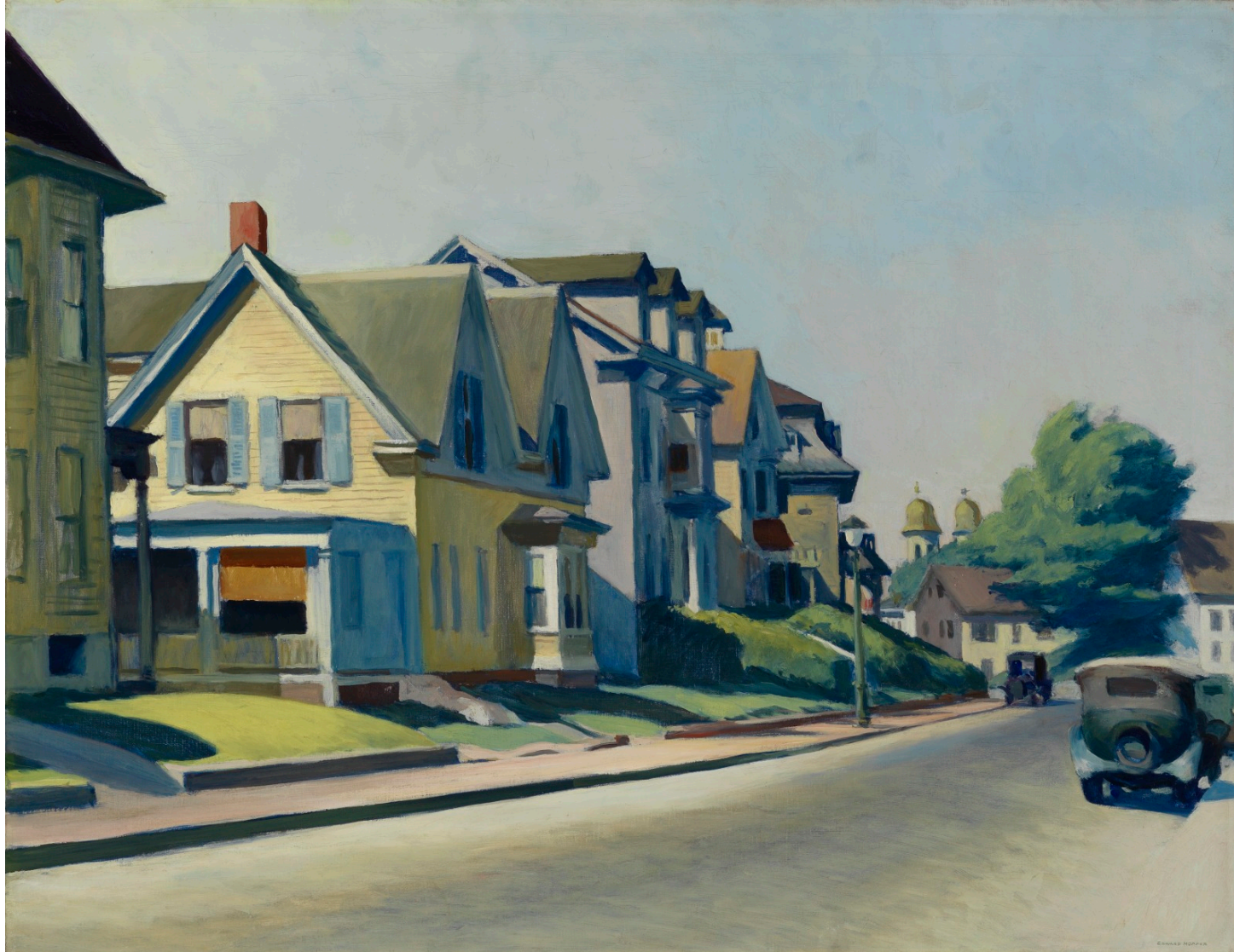
Edward Hopper (1882-1967), United States, Sun on Prospect Street (Gloucester, Massachusetts) , 1934, oil on canvas, The Edwin and Virginia Irwin Memorial, 1959.49