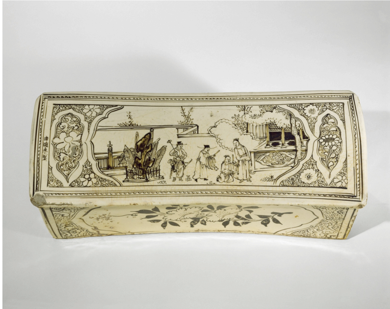
China, Ceramic Pillow , Late 13th century, stoneware, Cizhou ware, Museum Purchase, 1950.53

You are part of the story depicted, what role do you play?