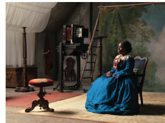
Isaac Julien (British, active United States and United Kingdom, b. 1960), The Lady of the Lake (Lessons of The Hour) , 2019, inkjet print mounted on aluminum, Museum Purchase: Carl Jacobs Foundation, 2020.41