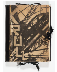
Germaine Krull (French, b. Prussia, 1897–1985), Métal, 1928, collotype plates loose laid in folding case with printed paper cover, black cloth spine and ties, Library Transfer, 2019.298.1–41