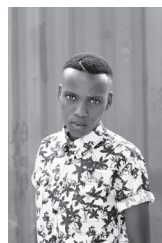
Zanele Muholi (South African, b.1972), Refiloe Pitso, Daveyton, Johannesburg , 2014, gelatin silver print, Museum Purchase: Carl Jacobs Foundation, 2017.70, © Zanele Muholi