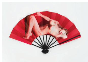
Yasumasa Morimura (Japanese, b.1951), Aimai-No-Bi (Ambiguous Beauty) , 1995, offset lithograph printed on paper fan in wooden box, with original Norton Family Christmas card, Museum Purchase: FotoFocus Art Purchase Fund, 2020.167, © Yasumasa Morimura