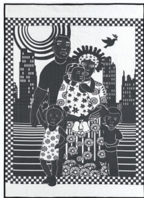
Carolyn L. Mazloomi (American, b. 1948), Sacred Union , 1999, printed and stenciled cotton, machine quilted, Fashion Arts and Textile Deaccession Fund, 2021.8 © Carolyn L. Mazloomi