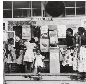
Gordon Parks (American, 1912–2006), Untitled, 1956, vintage gelatin silver print, Museum Purchase: Lawrence Archer Wachs Fund, 1999.15