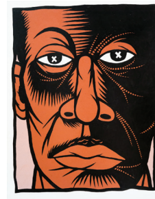
Thom E. Shaw (American, 1947–2010), Today I am No One , What About 2 Hours from Now , date unknown, acrylic on canvas, Museum Purchase: Jimmie Otten Gillespie Memorial, 2015.62, © Estate of Thom E. Shaw