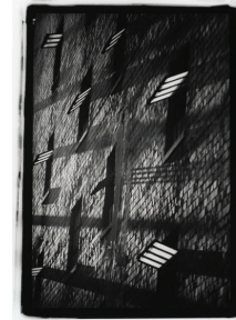
Melvin Grier (American, b. 1942), Walnut Garage Windows , undated, gelatin silver print, Museum Purchase: FotoFocus Art Purchase Fund, 2016.103, © Melvin Grier