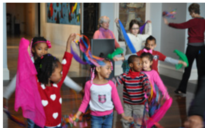
Family First Saturday