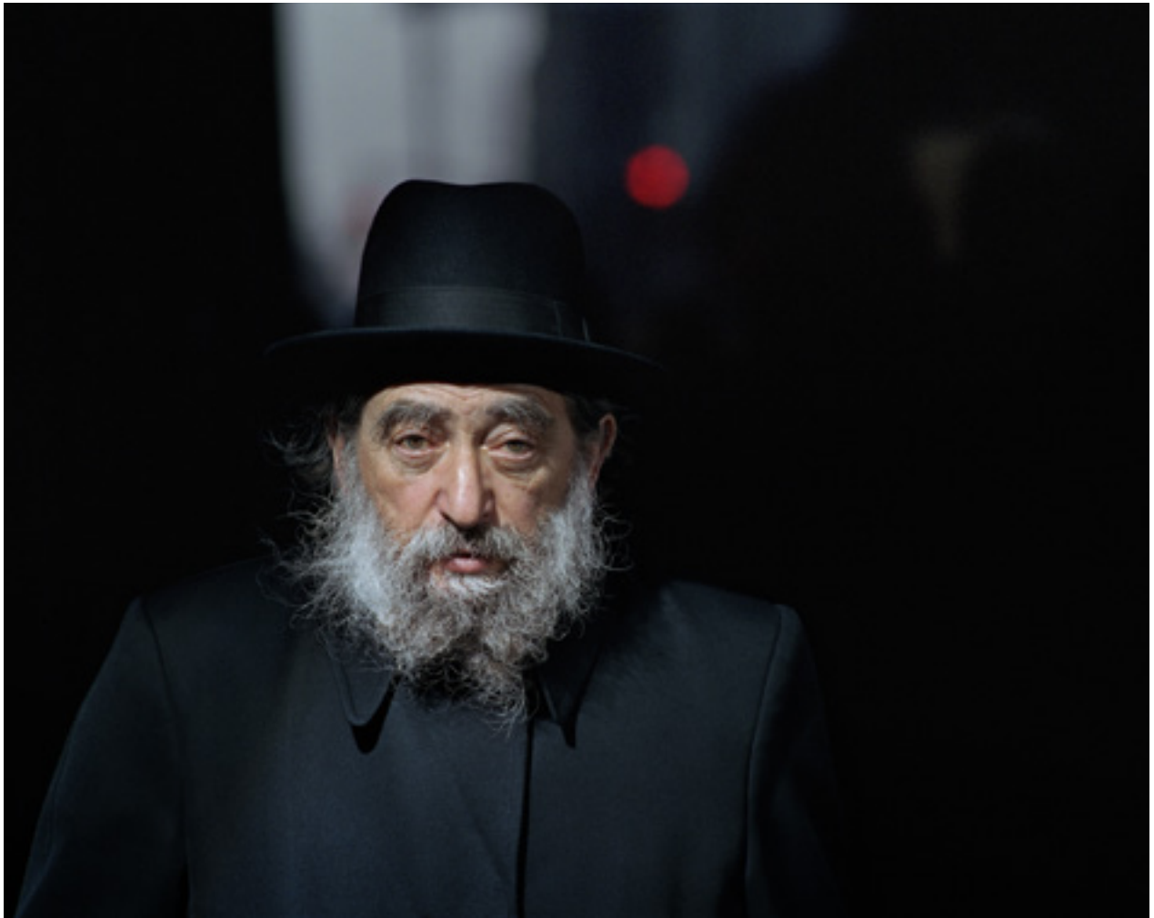
Phillip-Lorca diCorcia, Head #13 , 2001, Fujicolor Crystal Archive print, 48x60 inches.

these artists use the particular capabilities of their cameras—high-speed and high-definition lenses; multiple or simultaneous exposures; “impossible” film shots; appropriated surveillance footage—to reveal new facets of the urban environment. This is a moment when discussion of cameras in public spaces revolves around policing and first-amendment rights. These artworks, made since 2000 in New York, Los Angeles, London, Beirut, Shanghai, Istanbul, and other cities, remind us that urban public places are also home to unequalled creative and imaginative possibilities. Featured artists include Olivo Barbieri, Philip-Lorca diCorcia, Jason Evans, Paul Graham, Mark Lewis, Jill Magid, James Nares, Barbara Probst, Jennifer West, and Michael Wolf.