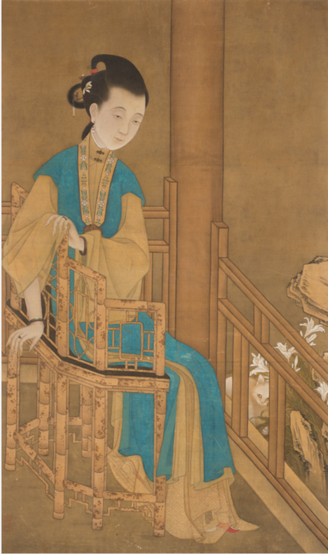
China, Qing dynasty (1644–1911), Portrait of a Lady , ink and colors on silk, 57x34 in. (146.1x88.3cm), Museum Purchase, 2013.14