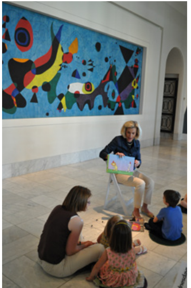
What My Child Can Do program, Spring 2013