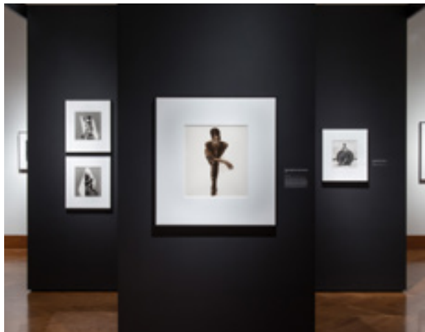
Installation of Herb Ritts: L.A. Style (October 6, 2012–January 1, 2013) in Gallery 234, The Thomas R. Schiff Gallery

The Collections: 6,000 Years of Art, Phase 2 (Open November 17, 2012–June 2, 2014)