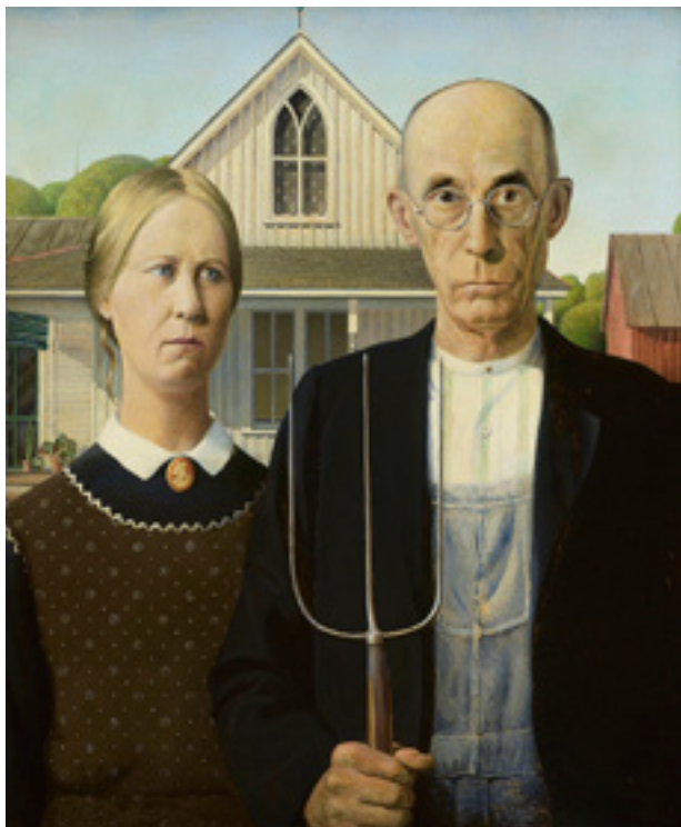
Grant Wood (American, 1891–1942), American Gothic , 1930, oil on Beaver Board, 30 3/4 x 25 3/4 in. (78.1 x 65.4 cm) The Art Institute of Chicago, Friends of the American Art Collection, 1930.934

to Chicago. This exhibition is one of a series of focus shows designed to illuminate key works in the Cincinnati Art Museum's collection. In Cincinnati, Wood's paintings will be combined with other quintessential works by artists of the Regionalist Movement including John Steuart Curry's Baptism in Kansas , on loan from the Whitney Museum of American Art, New York. Visitors will be encouraged to compare these works, stimulating lively conversation about the definition of "realism" as an artistic style, small town and rural life, stereotypes, nationalism, and what it means to be an American.