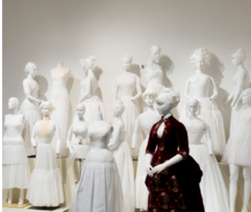
Installation view of Behind the Seams: Exhibiting and Conserving Fashion and Textiles (December 22, 2012–April 28, 2013) in Gallery 125, Vance Waddell Gallery.

Cincinnati Everyday (May 25–September 22, 2013)