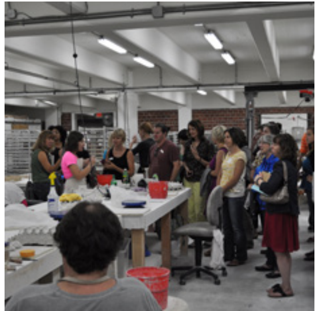
Summer Teacher Institute 2013 at the Rookwood Pottery Factory in Over-the-Rhine