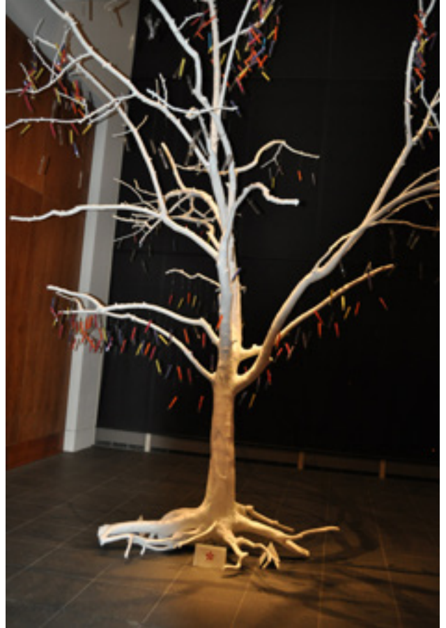
Tree of Life, December 2013