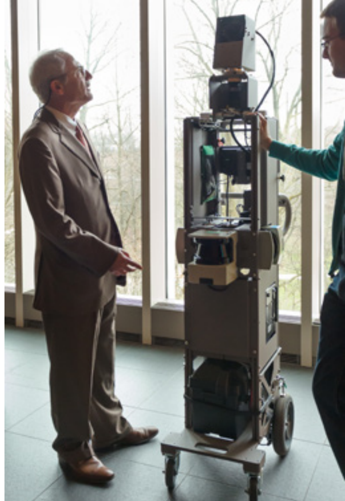
Google Art Project launch, Spring 2013

I hope you enjoy everything this report has to offer, but more importantly, I hope you will come visit us after reading it. We look forward to seeing you soon.