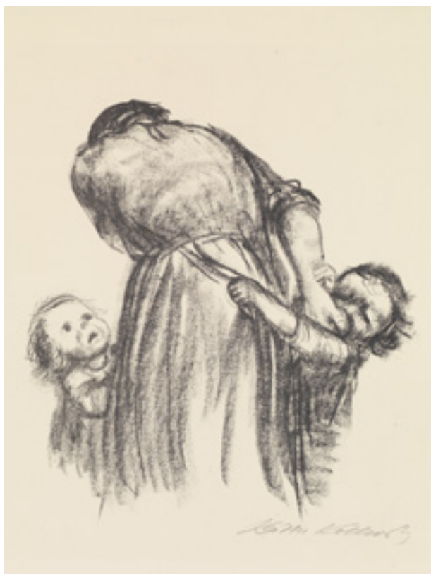
Käthe Kollwitz (German, 1867–1945), Bread from "Hunger," 1924, lithograph, 12 1/8 x 11 3/16 in. (30.8 x 28.4 cm), Gift of Herbert Greer French, 1940.327, © Artists Rights Society (ARS), New York / VG Bild-Kunst, Bonn

Beyond our exhibitions and programming, we are continuing to make more room for art through our capital campaign. Plans have been drawn up and we are close to reaching our fundraising goal for the next phase of renovations. These will create a new art education center on the first floor of the Art Museum, as well as several new permanent collec-